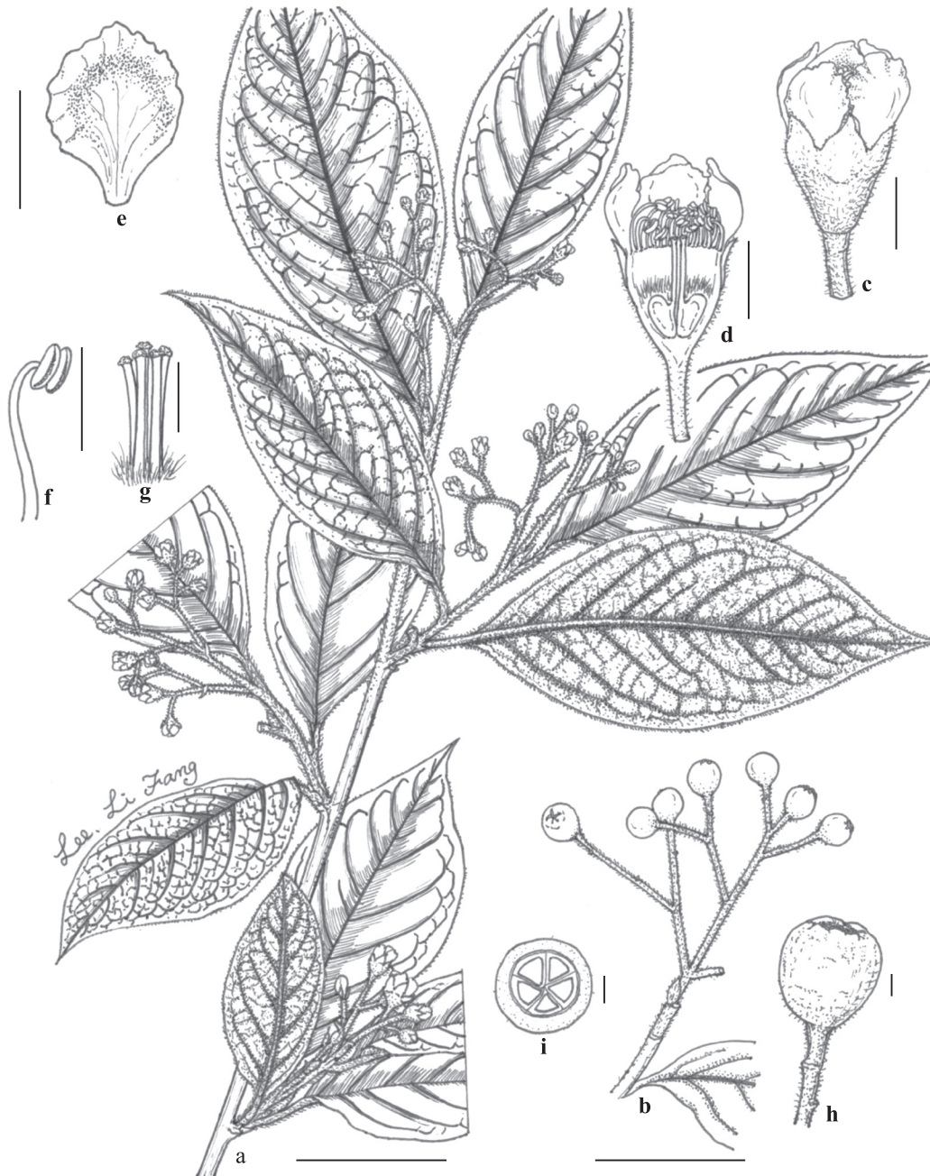
Fig. 1. Cotoneaster bullatus Bois. a, habit; b, fruiting branch; c, flower; d, vertical-section of flower; e, petal; f, stamen; g, styles; h, pome; i, cross-section of pome. (scale: a, b = 3 cm; c-e, h, i = 2 mm; f, g = 1 mm).

Deciduous shrub or small tree, branchlets columnar, blackish-brown to grayish-black, with prominent lenticels, initially pilose.